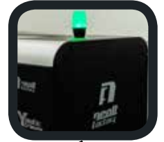
Innovative automatic cutting unit