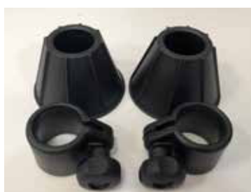
Couple of cones and hold rings