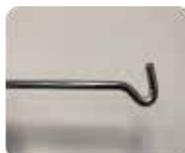
Additional Chrome Support