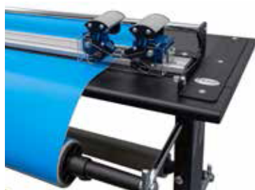
Cutting system (RH / Easy cut 165)