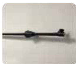
Additional Roll Holder